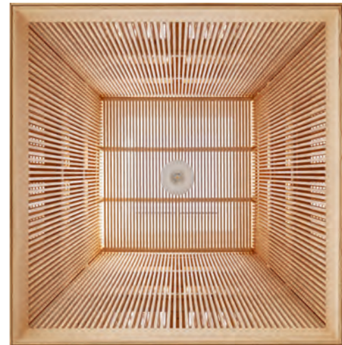
Wooden boarding skylight