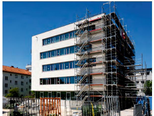
Building shortly before completion