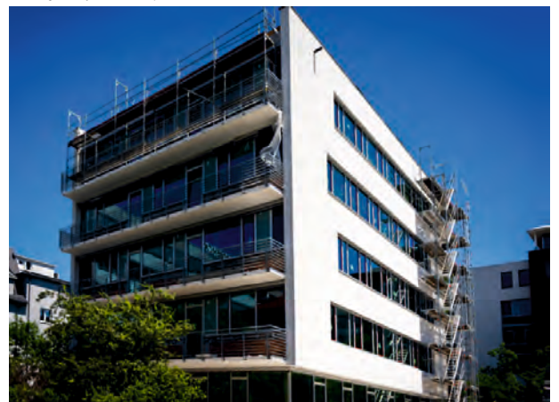
Building shortly before completion