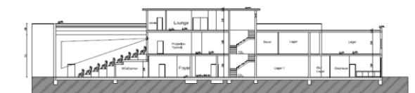
Section 1 (Cinema auditorium, roof lounge, adjoining rooms)