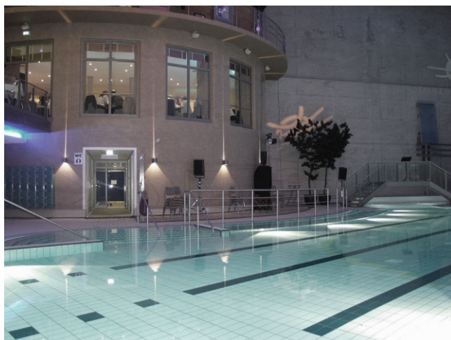
Pictures / Illustrations: ProfessorPfeiferandPartner PartGmbB, GMA_Architekten