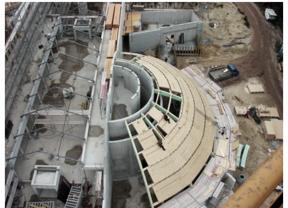
In construction, late summer / autumn 2001